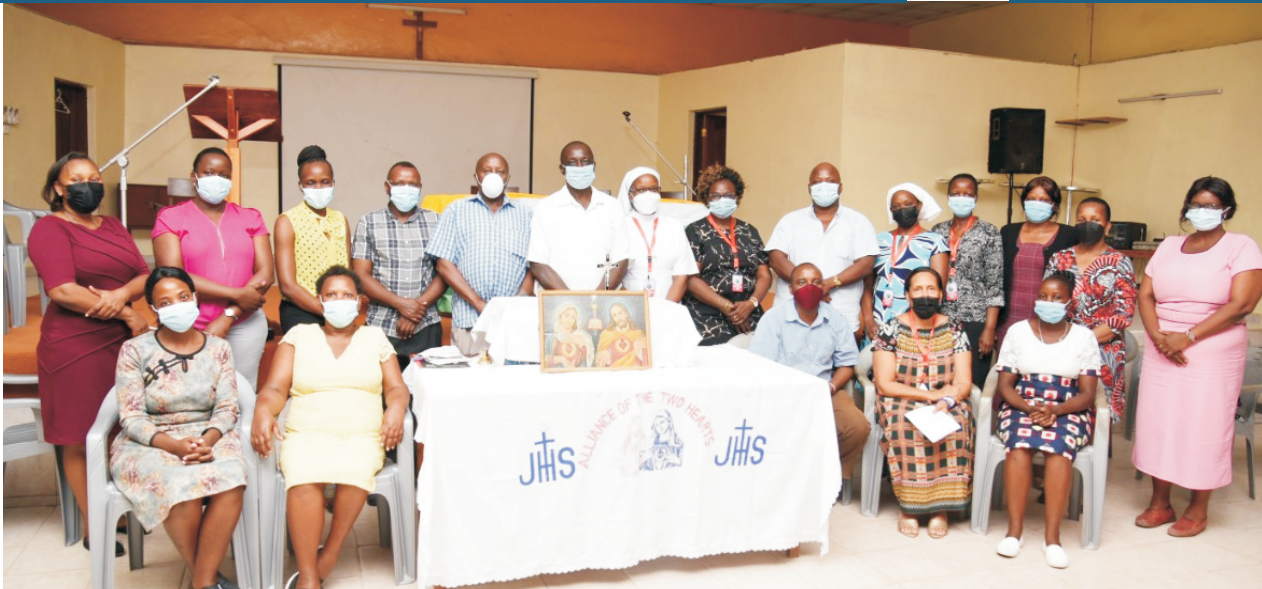
Alliance of two Hearts SCC members with the Liturgy Ministry officials during a recent interactive session at the main Hall.