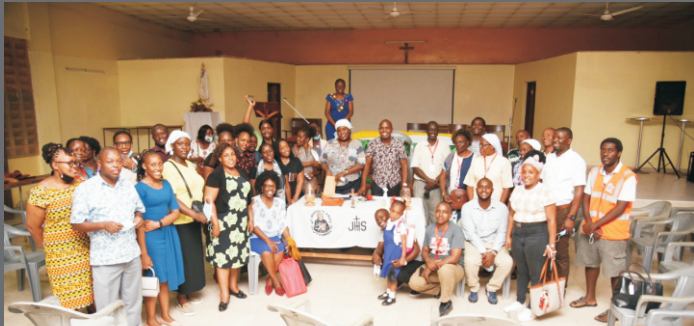
St. Benedict Jumuiya meets every Wednesday after 5:30pm Mass at main Hall. Membership is from people across the bridge, Mikindani, Bamburi, Mshomoroni etc