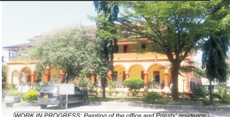
WORK IN PROGRESS: Painting of the office and Priests' residence Colors of the earth on the exterior